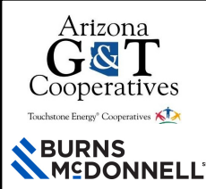
Exhibit A Proposed Route Saguaro-Marana 115/138kV Transmission Line Project Arizona G&T Cooperatives